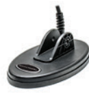
IM19 Waterproof DD Search Coil & Cover 19 x 10 cm (7.5" x 4")