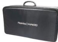
NMS20/30 Carrying Case